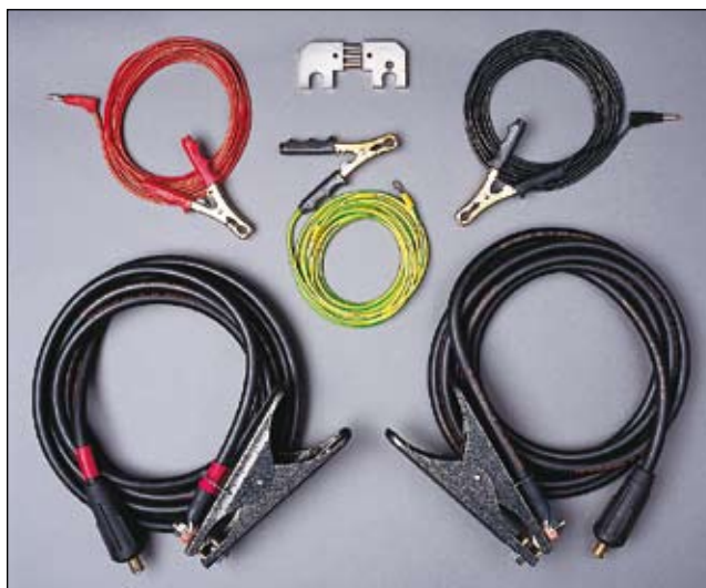
Cable set and current shunt