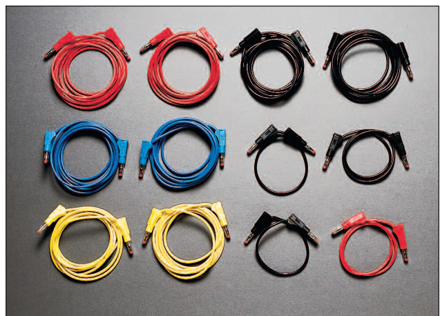
Test lead set