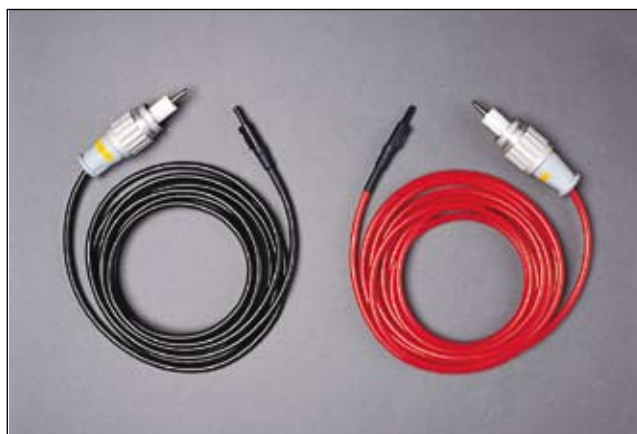
Cable set GA-00090