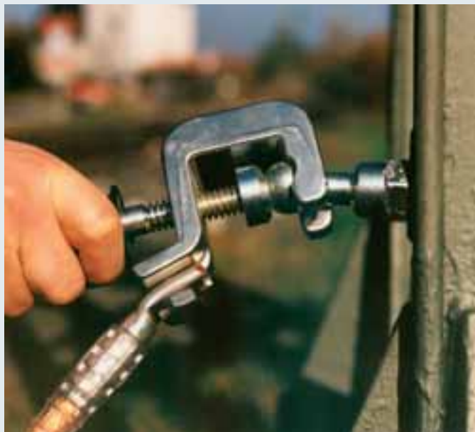
Universal earth clamp with insulated handle connected to a fixed ball point.