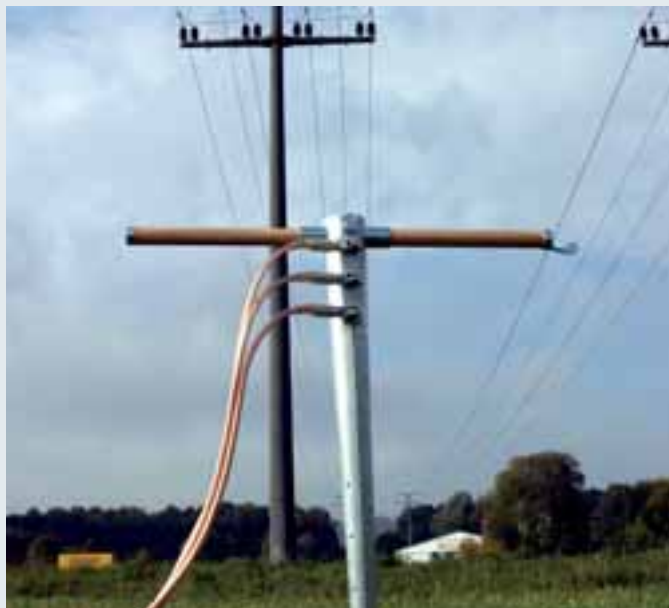
Earthing busbar and earthing cables mounted on a tubular earth electrode.