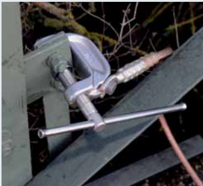
Earth milling clamp used for coated steel masts.