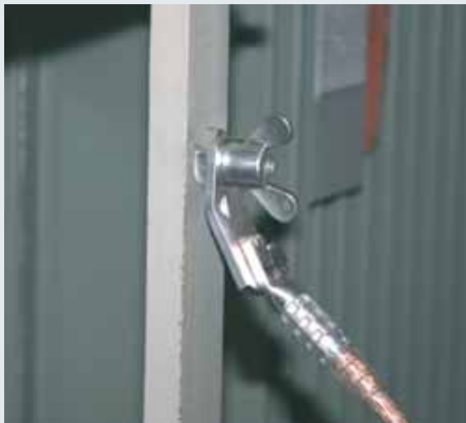
Earth connection unit with wing bolt.