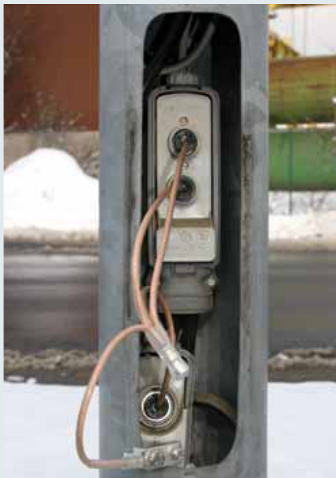
Earthing and short-circuiting device installed at a junction and fuse box of a street lighting mast.