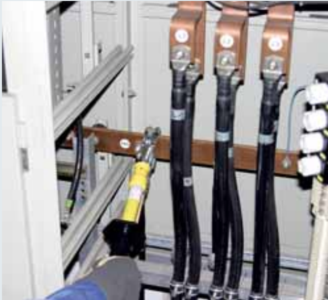
Installation of an earthing and short-circuiting device into a low-voltage switchgear installation using an earthing handle