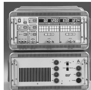
The EPOCH-20 with the EPOCH-10 control unit