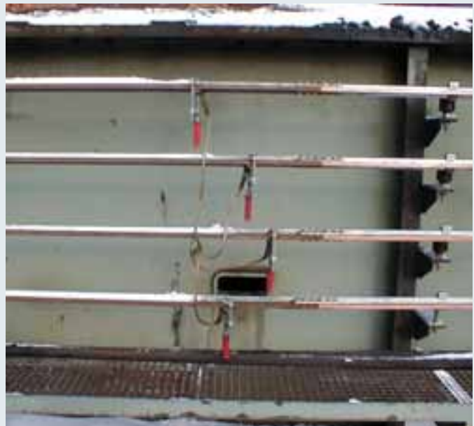
Three-pole earthing and short-circuiting device with clamps.