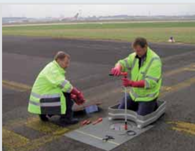
The GRP extension is used as insulating intermediate section when attaching the illuminant.