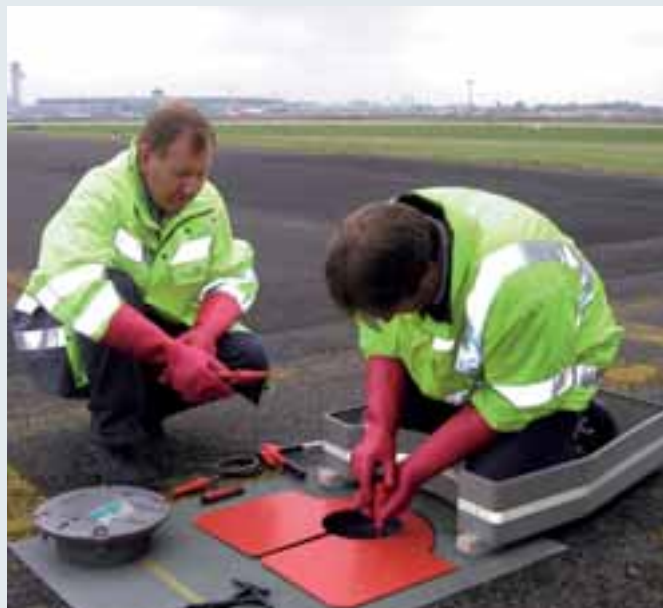
Replacement of a faulty illuminant (airport lighting system) at a runway.