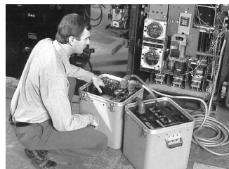
Model NTS-300 testing a Westinghouse network protector