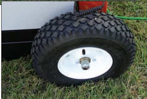
The large wheels facilitate easy field transportation over irregular surfaces.