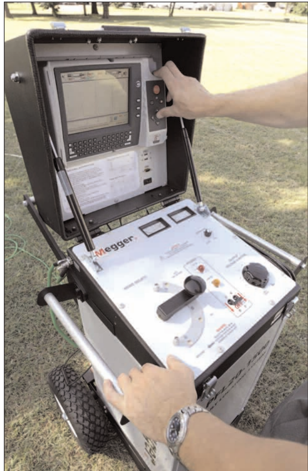
The PFL20M1500 provides the user with a product that facilitates effective fault finding.