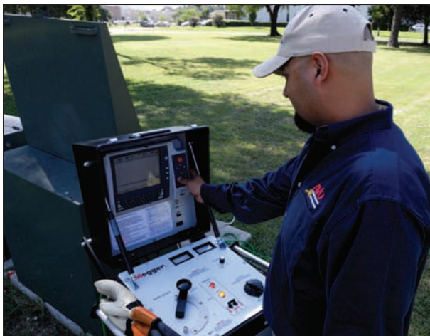
One of the new features of the PFL20M1500 is the lid-mounted MTDR which offers multiple test modes and simple, easy pushbutton operation.

The PFL20M1500 includes a set of outstanding new features including a simple-to-operate MTDR built into the lid and an inductive arc reflection filter to deliver more energy to the fault. An on-board inverter provides the user a choice of input power options.