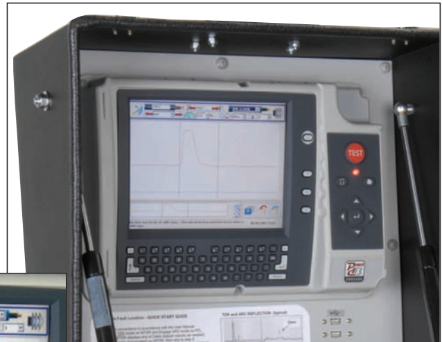
New style MTDR is mounted in the lid for easier viewing with a large, bright screen.