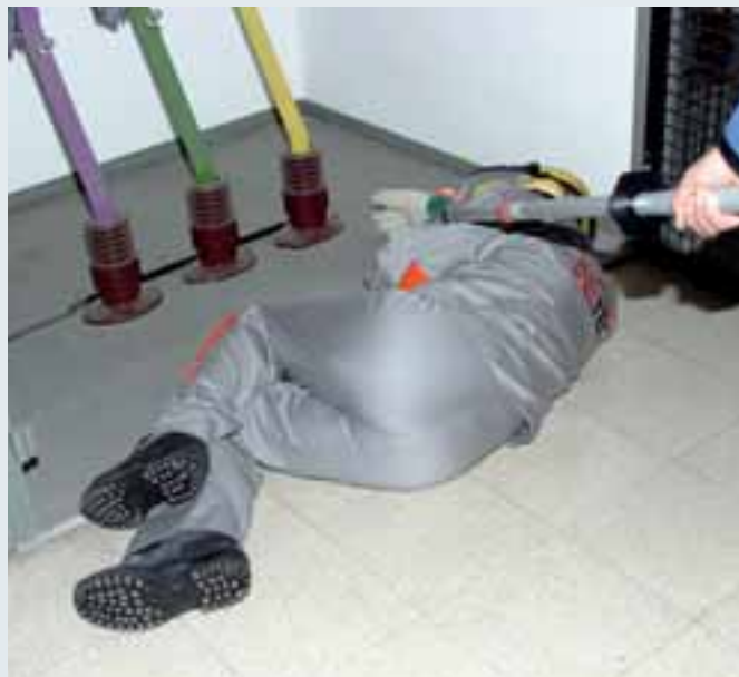
Rescuing an electric shock victim from the live working zone by means of an insulated RST rescue rod.