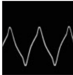
Current waveform (without filter)