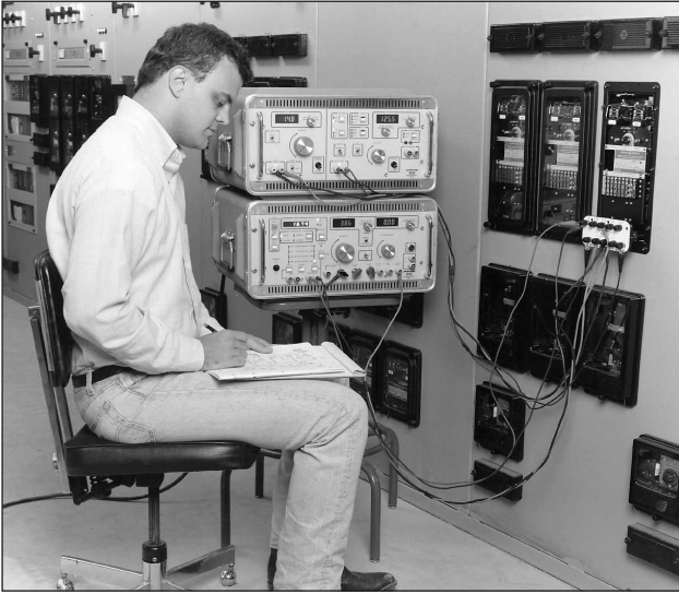
Model SR-90, with Units 1 and 2 stacked, tests a current differential relay in a panel.