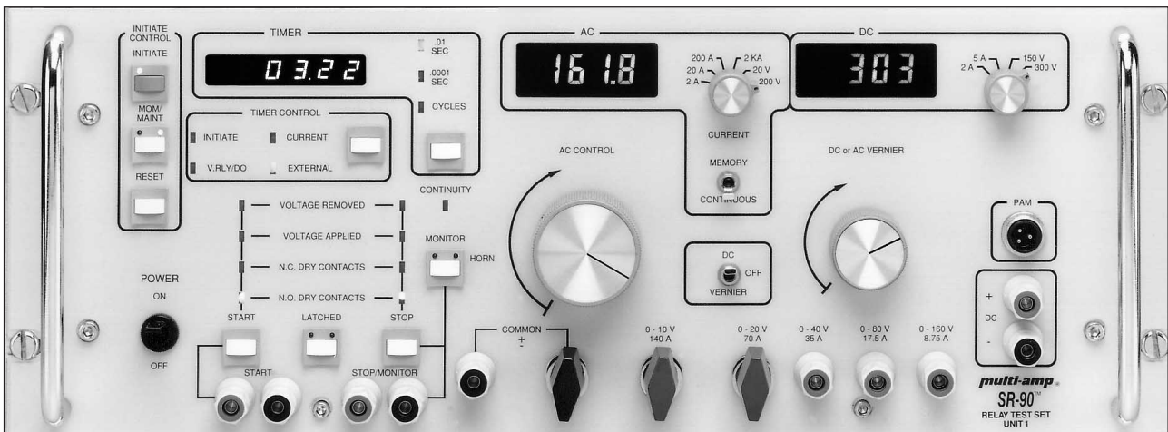
The Control Unit (Unit 1) of Model SR-90