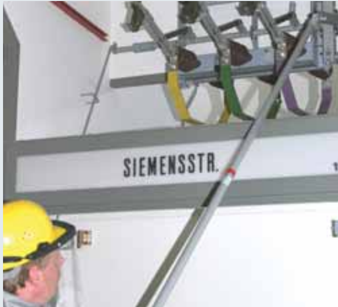
Switching a disconnector using an SCS switching rod.