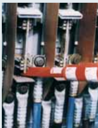
Chamfered flat cleaning head in use.

TRS NS allows maintenance work to be done under supervision of a qualified electrician at voltages up to 1000 V according to EN 50110-1 "Operation of electrical installations – Minimum Requirements". In Germany apply sections BGV A3 and of the national accident prevention regulations (UVV) "Elektrische Anlagen und Betriebsmittel" [Electrical installations and equipment] issued by the German Employer's Liability Association for Precision and Electrical Engineering (BGFE).