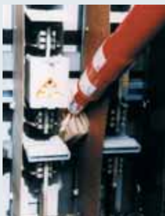
Tubular brush in use.