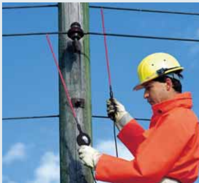
Two-pole SPN voltage detector used with extension prods in overhead lines.